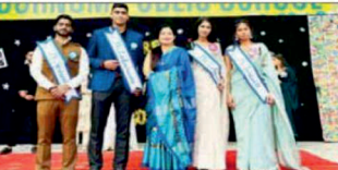
सोहन, उत्तरांचल के आदर्श गांव भौड़सी स्थित लेबरनम पब्लिक स्कूल में अंतर विद्यालयी प्रतियोगिता का आयोजन हुआ। विद्यार्थियों ने विभिन्न खेलों में भाग लिया और अच्छे प्रदर्शन दिखाया।

सोहन, उत्तरांचल के आदर्श गांव भौड़सी स्थित लेबरनम पब्लिक स्कूल में अंतर विद्यालयी प्रतियोगिता का आयोजन हुआ। विद्यार्थियों ने विभिन्न खेलों में भाग लिया और अच्छे प्रदर्शन दिखाया।