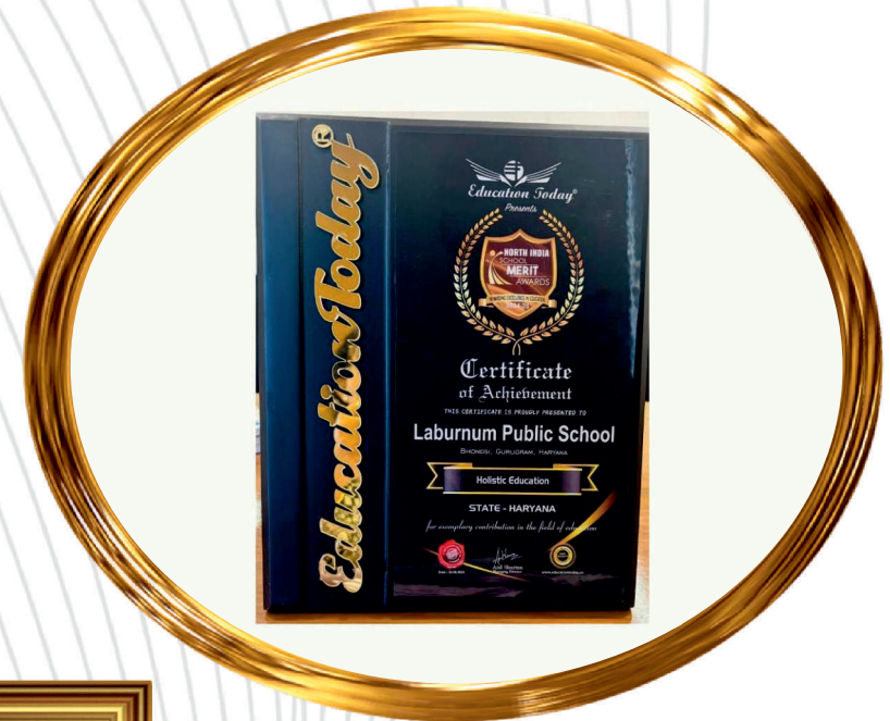
HOLISTIC EDUCATION AWARD BY EDUCATION TODAY