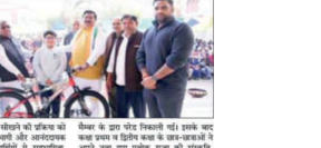
लेबरनम विद्यालय में उषार में लोटोंप, मोबाइल और साइकिल पाकर विद्यार्थियों के खिले चेहेरे। विद्यार्थियों को बढकर सहभागिता निमाई का अवसर मिला।

लेबरनम विद्यालय में उषार में लोटोंप, मोबाइल और साइकिल पाकर विद्यार्थियों के खिले चेहेरे। विद्यार्थियों को बढकर सहभागिता निमाई का अवसर मिला।