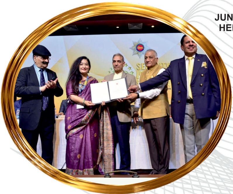
HONORED FOR VISIONARY LEADERSHIP AND CYBERSECURITY AMBASSADOR AWARD 2024 BY CAPSI