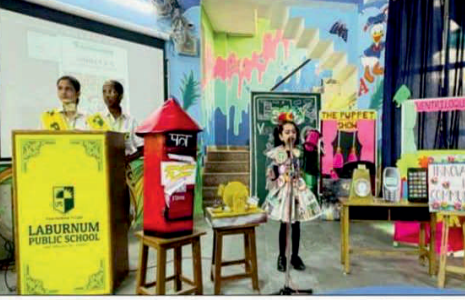
सोहन, उत्तरांचल के आदर्श गांव भौड़सी स्थित लेबरनम विद्यालय में अंतर विद्यालयी प्रतियोगिता का आयोजन हुआ। विद्यार्थियों ने विभिन्न खेलों में भाग लिया और अच्छे प्रदर्शन दिखाया।

सोहन, उत्तरांचल के आदर्श गांव भौड़सी स्थित लेबरनम विद्यालय में अंतर विद्यालयी प्रतियोगिता का आयोजन हुआ। विद्यार्थियों ने विभिन्न खेलों में भाग लिया और अच्छे प्रदर्शन दिखाया।