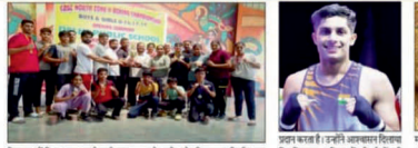
सोहन, उत्तरांचल के आदर्श गांव भौड़सी स्थित लेबरनम पब्लिक स्कूल के विद्यार्थियों ने राज्यस्तरीय प्रतियोगिता में मेडल जीत लिया। यह जीत सोहना के नाम गौरान्वित है।

सोहन, उत्तरांचल के आदर्श गांव भौड़सी स्थित लेबरनम पब्लिक स्कूल के विद्यार्थियों ने राज्यस्तरीय प्रतियोगिता में मेडल जीत लिया। यह जीत सोहना के नाम गौरान्वित है।