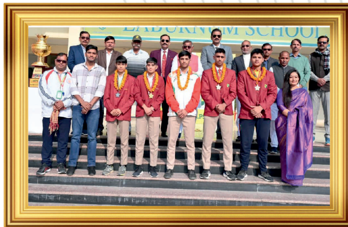
JUNIOR WORLD CHAMPIONSHIP HELD IN YEREVAN, ARMENIAN