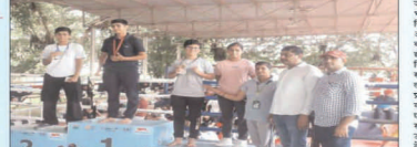
सोहन, उत्तरांचल के आदर्श गांव भौड़सी स्थित लेबरनम पब्लिक स्कूल के विद्यार्थियों ने राज्यस्तरीय प्रतियोगिता में गोल्डमेडल जीत लिया। यह जीत सोहना के नाम गौरान्वित है।