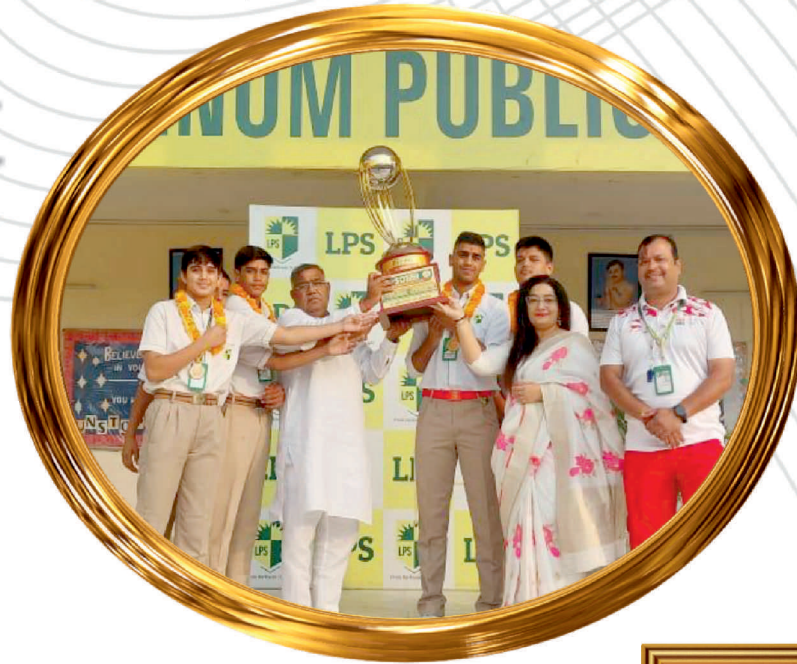
FIRST RUNNER-UP POSITION AT CBSE NATIONAL BOXING TOURNAMENT 2023-24 & 2024-25